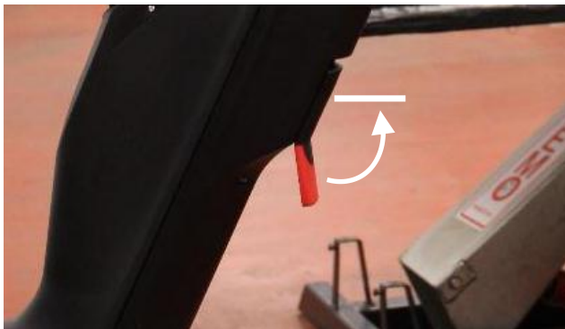
1.7 Open lever to (horizontal) position and extend the stem.