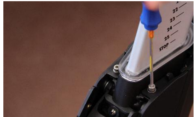
1.8 Remove 2 bolts with a 3 mm straight Allen key