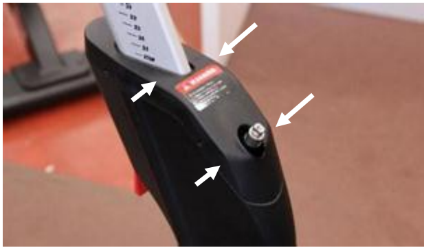
1.5 Remove 4 bolts with 2 mm Allen key.