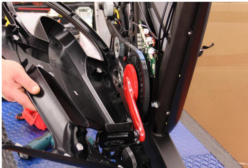
1.13 Slightly tilt the shroud and gently pull it by the pedal without detaching the rubber spacers from the shroud.

Reverse these steps to reattach the shroud.