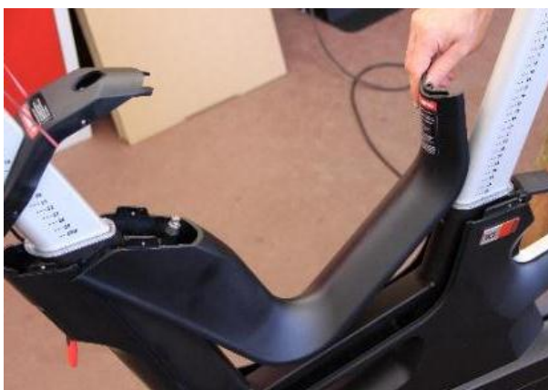
1.9 Lift seat post and handlebar top cover and remove top main cover.