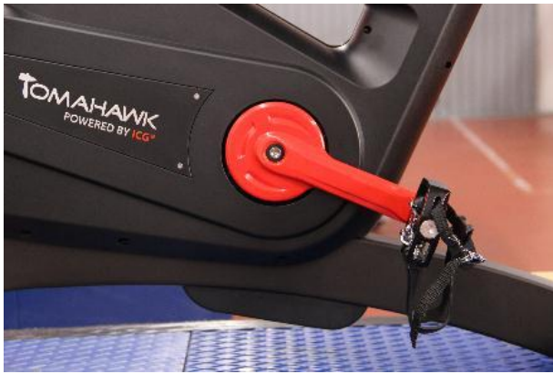
1.11 Turn the crank to the above position so the shroud can be maneuvered past the pedal