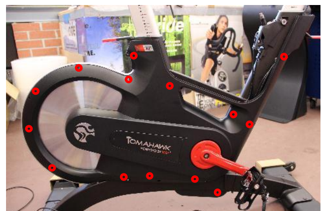
1.10 Remove 14 bolts from the shroud on the right side with a 3 mm straight Allen key.