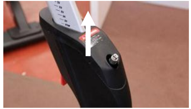
1.6 Lift handlebar top cover